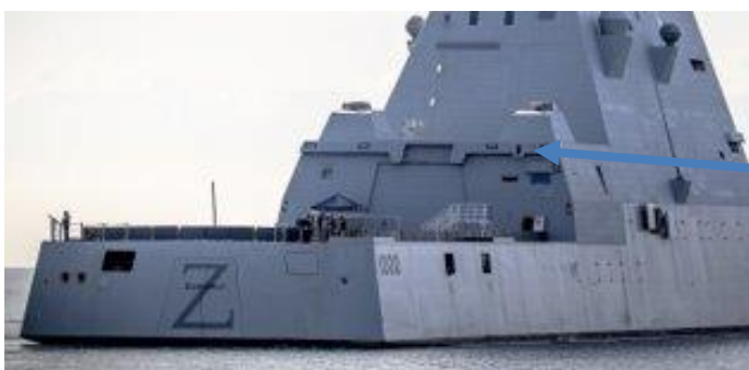
Location of the Deck Status Light onboard USS ZUMWALT (DDG 1000)